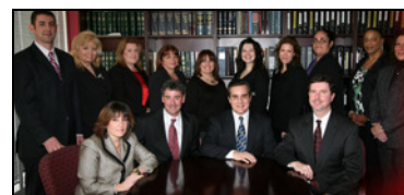
Audette, Bazar, Cordeiro & Grasso, Inc.

Every month I choose one very special person to be my "Client Of The Month." It's my way of acknowledging clients and thanking those who support me and my business with referrals and repeat business. This month's Client Of The Month is Audette, Bazar, Cordeiro & Grasso, Inc. Congratulations! You have won a $50 Gift Certificate to your favorite restaurant. You might be my next Client Of The Month...watch for your name and picture here!