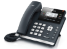
Yealink T4 series