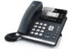
Yealink T4 series