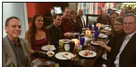
Michigan CFO Holiday Dinner at Texas de Brazil in Downtown Detroit