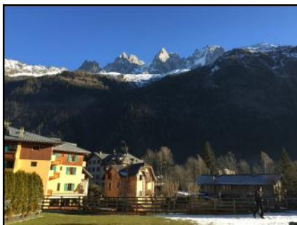
Mont Blanc in Chamonix, France