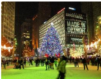
Campus Martius Ice Rink

43230 Garfield Road, Suite 130 Clinton Township, MI 48038 586.580.3285