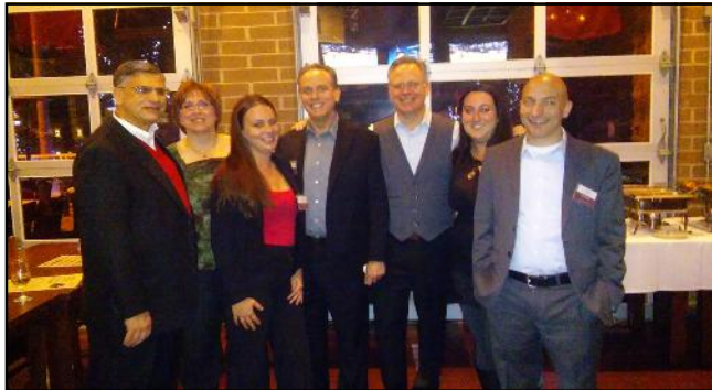
Happy Holidays from your Friends at Michigan CFO Associates!