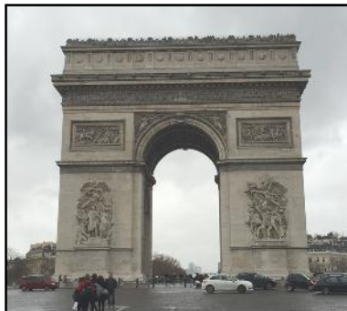
Arc de Triomphe Paris, France

So while watching cows blur by the French countryside, and secretly hoping there would be no more meals with cheese as a "main course", I remembered a strategy session I attended five-ish years ago where a similar, but broader question was posed: "If you had $1M available to grow your business, what would you do with it?"