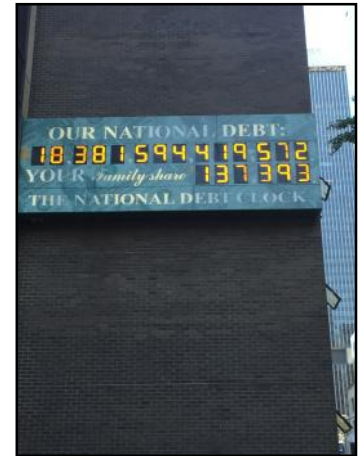
Todd photographed the National Debt Clock in NYC in October (It's grown since then!)