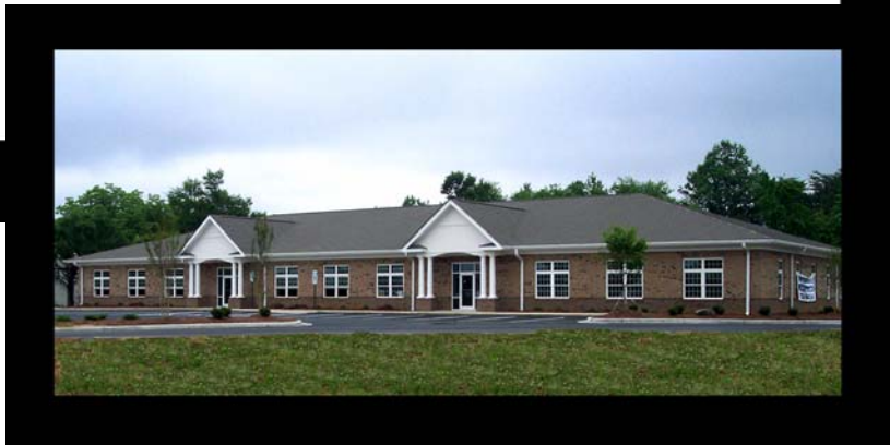
Located in Burlington, Kirkpatrick Professional Center is convenient to the Triad and Triangle areas.