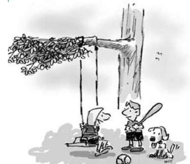
"Dad doesn't need summer off. He plays at work all day with something called mutual furs!"