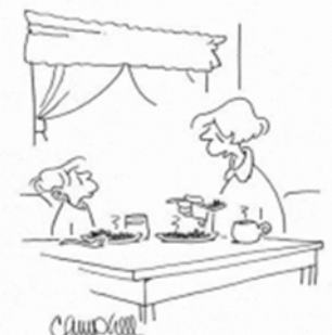
"No, you don't get to choose between the wearin' of the green and the eatin' of the green."