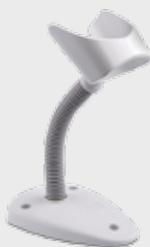
▪ STD-G040-WH: Basic Stand, G040, White