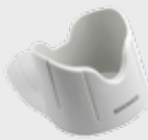
▪ HLD-G040-WH: Desk/Wall Holder, G040, White