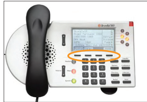
Figure 14: Soft keys provide context-sensitive operations, making the phone easy to use.