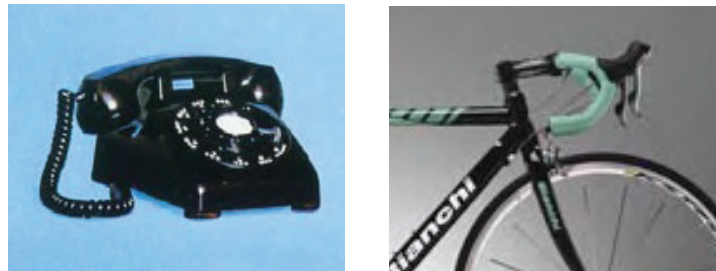
Figure 1: The Bell “500” desk phone, and bicycle handlebars.

ShoreTel also looked to the sleek design of the Audi dashboard, which puts all the controls within the easy reach of the driver. Similarly, ShoreTel put all of the controls for the telephone within easy reach and sight.