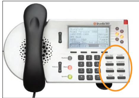
Figure 13: ShoreTel has grouped together the most common feature keys for consistent, easy access. This includes transfer, conference, intercom, hold, voicemail, options, directory and redial.