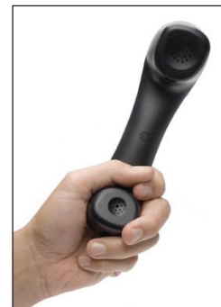
Figure 10: The mouthpiece has rounded corners so a user may comfortably hold the handset around the mouthpiece.