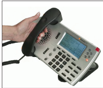
Figure 12: When you pick up the handset, you'll find the handset conforms to the shape of your hand.

It's easy to pick up a ShoreTel IP Phone because there's plenty of room created by the curvature of the handset which lines up against the inverse curvature of the phone base. Sized appropriately, the handset fits neatly into the hand. Picking up a conventional bar-shaped phone can be clumsy because there isn't enough space between the handset and the base. This can result in hanging up on a caller by knocking the phone while trying to pick it up.