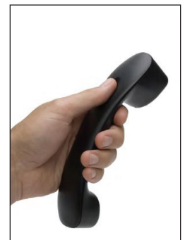
Figure 11: A user may hold a handset with a thumb on the back, using the finger notch.