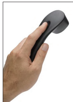
Figure 9: A user may hold the handset with an index finger on the back, so there is a finger notch.