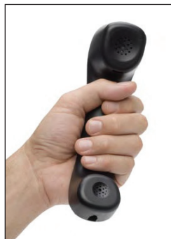
Figure 8: The handset can be held across the saddle, with the handset matching the curves of the hand.

ShoreTel designed the handset to be held in multiple ways. Business professionals spend hours on the phone and how a person holds a handset depends on personal preferences and other tasks he or she performs simultaneously, like typing or using the telephone keypad. The handset has a slim waist, so users can easily grip it around the middle, pick it up in different ways, or hold it by the mouthpiece. Many other handsets on the market are designed with hard angles that feel awkward against the hand's natural curvature.